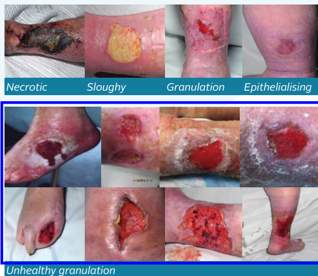
Figure 2. Tissue types and examples of unhealthy granulation tissue

reinforce the idea that this type of tissue is a barrier that can be overcome in hard-to-heal wounds.