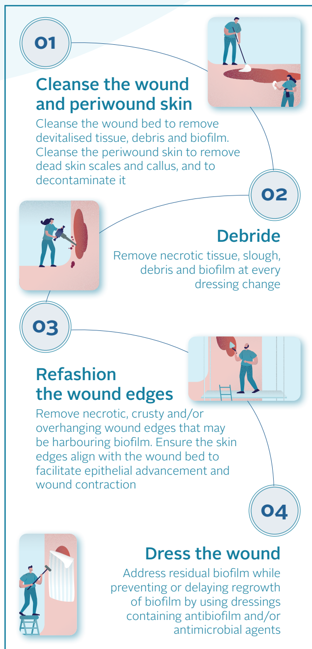
Figure 1. The four activities of Wound Hygiene 1

whether biofilm is present when completing a routine wound assessment. 26 Furthermore, 70.1% (n=897) of respondents (N=1280) said they use an antibiofilm strategy to manage biofilm in wounds. 26 Over the last decade, biofilm management practices consisted of regular debridement followed by antibiofilm reformation strategies, including the use of topical antimicrobial dressings. 25